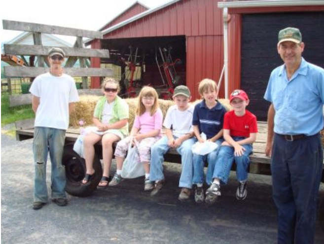
The Hay Ride on the Ambrose Farm Was Lots of Fun