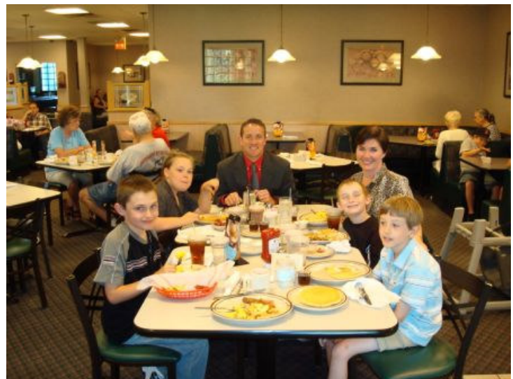
Enjoying God's Bounty at Denny's